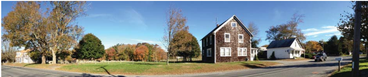
View from Adamsville Road towards the junction of Main Road from the Central Village US Post Office

On Tuesday, October 22, 2013, the Westport Planning Board invites you to the third Central Village Forum about the overall planning, design and future land use objectives for Central Village.