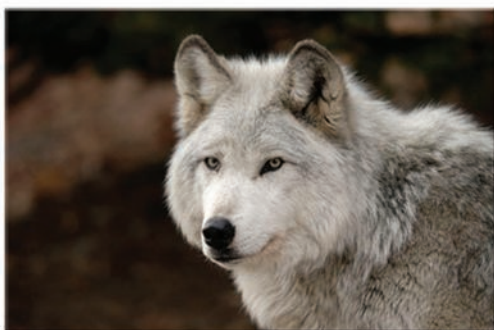
See Basic Listing