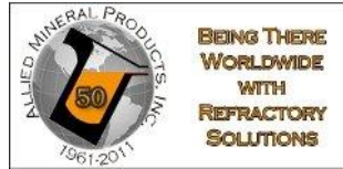
Allied Mineral Products